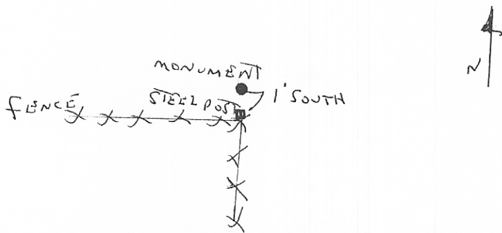
SKETCH OF CORNER