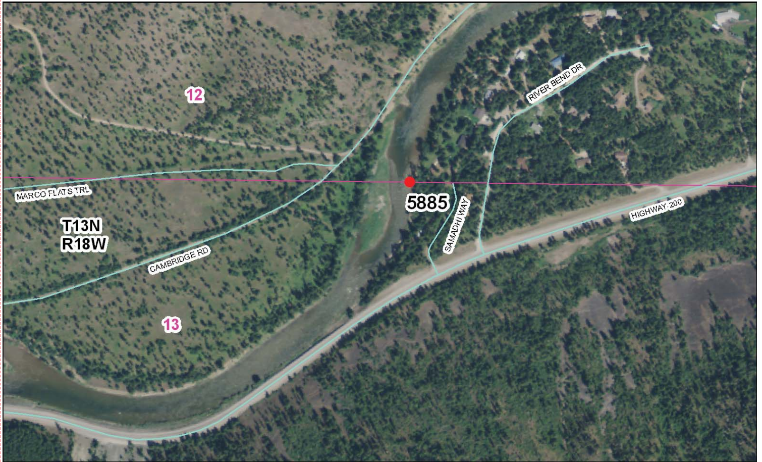
Map of Area

To Reach: 2wd access to within 200 feet of the monument.