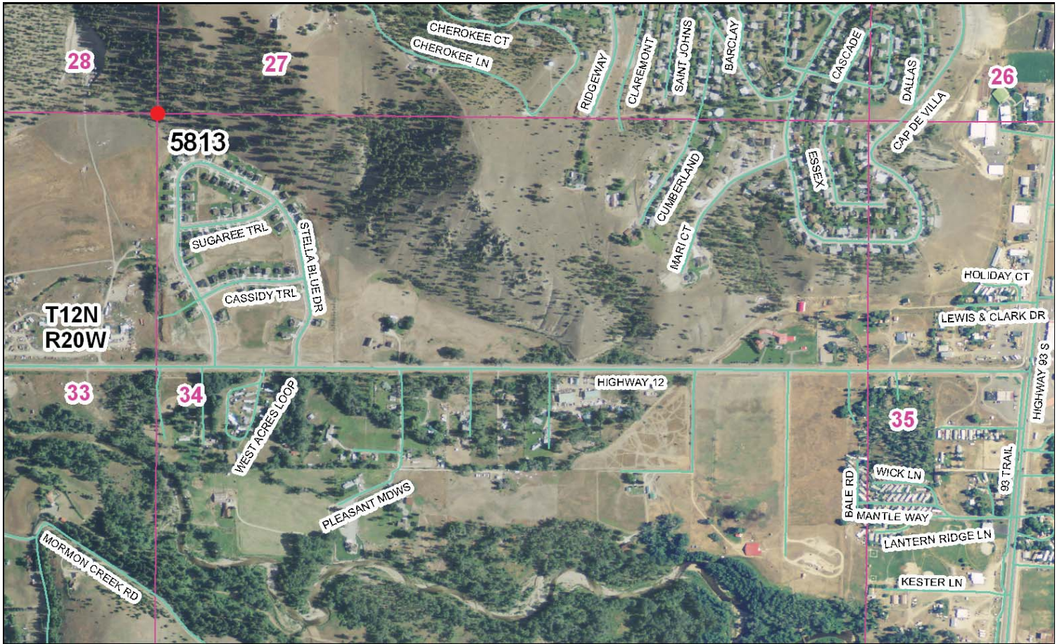
Map of Area

To Reach: 2wd access to within 450 feet of the monument.