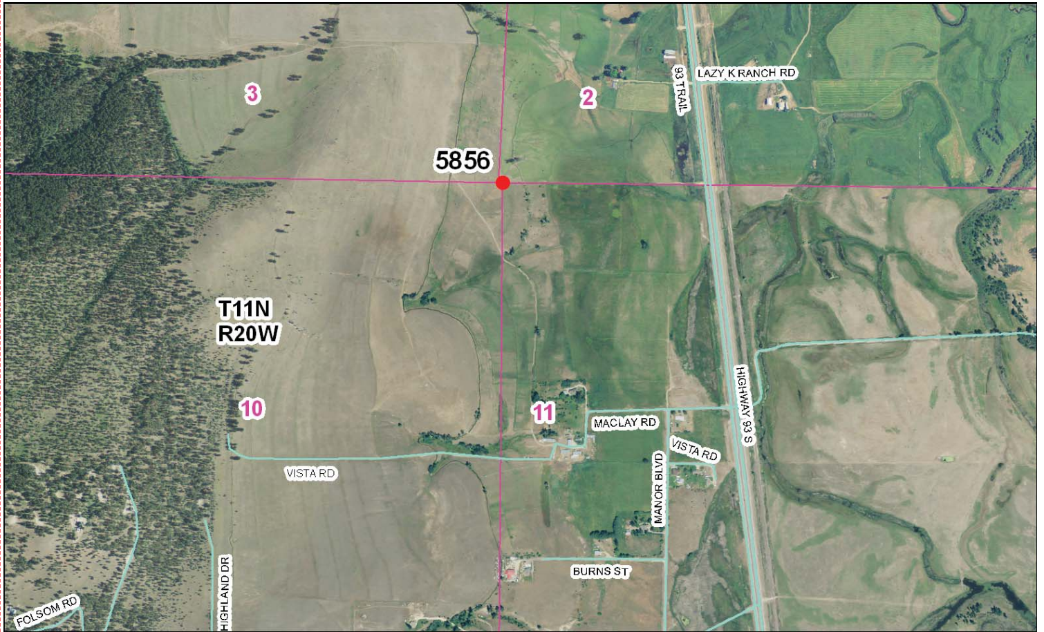
Map of Area

To Reach: 2wd access to within 100 feet of the monument, via a ranch road with permission from the McClay ranch.