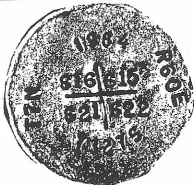
SKETCH OF CORNER