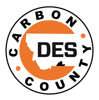
February 16, 2016

A grant application submitted to the Montana Land Information Act (MLIA) FY 2017 Grant Program